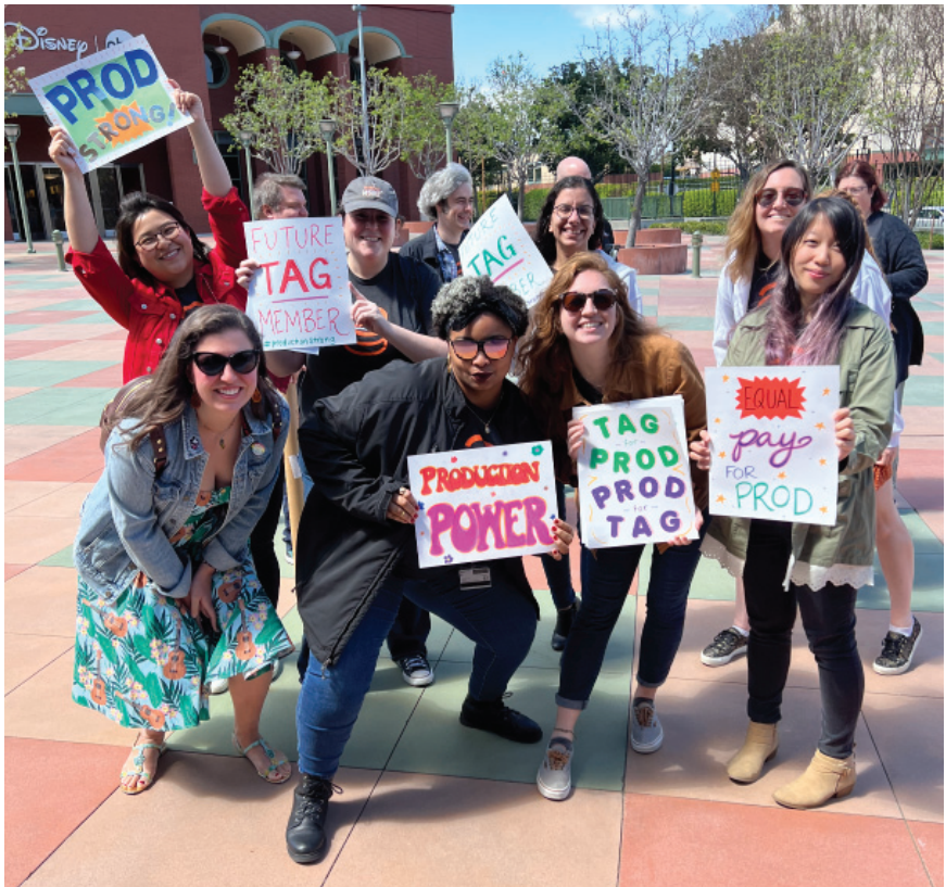
Production workers at Walt Disney Animation Studios gathered in solidarity to show their determination to be recognized as part of IATSE Local 839, The Animation Guild.

I live with a magical, bilingual dog that exhibits human behavior.