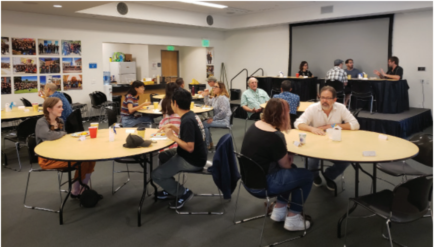
The first Peer-To-Peer Brunch in 2019 saw 57 TAG members networking to great effect at Hulett Hall. Sign up to attend the 2023 event and meet other members looking to connect.

This event was originally run back in 2019, held in Hulett Hall, and had 57 attendees. It was a very successful event, and we wanted to bring it back ... but bigger and better! We felt holding it outside might help provide a venue both able to accommodate a larger number of members, as well as a safer venue for a wider variety of people. Even still, space is limited so please apply quickly! If we hit our cap, we will create a wait-list for additional interested attendees.